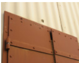
Porter prefabricated iron store_North Fitzroy_March 2010