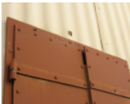
Porter prefabricated iron store_North Fitzroy_March 2010