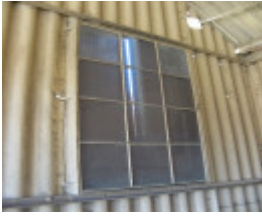
Porter prefabricated iron store_North Fitzroy_March 2010