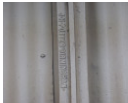
Porter prefabricated iron store_North Fitzroy_March 2010