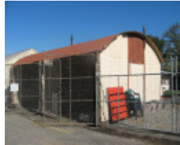
Porter prefabricated iron store_North Fitzroy_March 2010