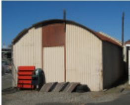
Porter prefabricated iron store_North Fitzroy_March 2010