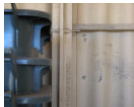
Porter prefabricated iron store_North Fitzroy_March 2010