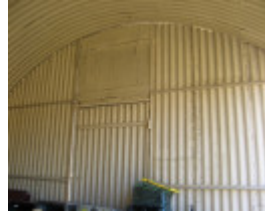
Iron store Fitzroy_KJ_25 Feb 2010.jpg