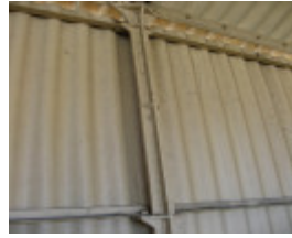
Porter prefabricated iron store_North Fitzroy_March 2010