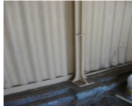
Porter prefabricated iron store_North Fitzroy_March 2010