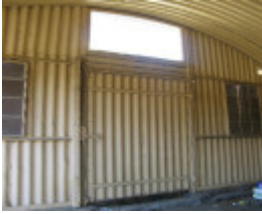
Porter prefabricated iron store_North Fitzroy_March 2010