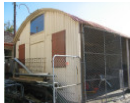
Porter prefabricated iron store_North Fitzroy_March 2010