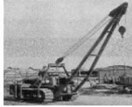
1944 Image Showing the Porter Prefab Iron Store on its present site in the Yarra Council Depot. Photographed from the adjacent site.