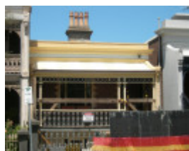
BUILDING SOHE 2008