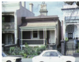
1 residence 130 powlett street east melbourne front elevation