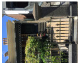
RESIDENCE October 2016