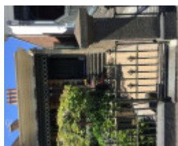
RESIDENCE October 2016