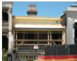
BUILDING SOHE 2008