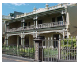
ardee 166 victoria parade east melbourne front elevation oct1999