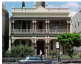
ardee 166 victoria parade east melbourne front view oct1999