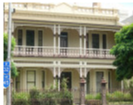
ARDEE SOHE 2008