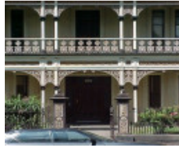
ardee 166 victoria parade east melbourne entrance detail oct1999