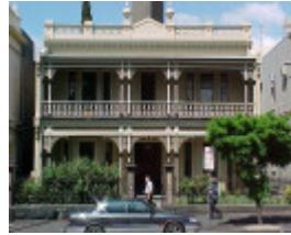
ardee 166 victoria parade east melbourne front view oct1999