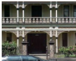
ardee 166 victoria parade east melbourne entrance detail oct1999