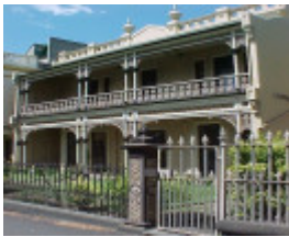
ardee 166 victoria parade east melbourne front elevation oct1999