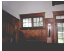
h01998 bruce manor frankston internal joinery 01 mz 1103