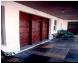
H01998 bruce manor frankston rear verandah