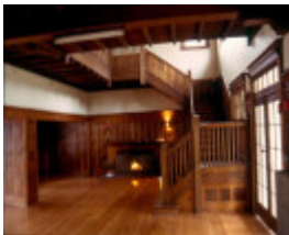
h01998 bruce manor frankston internal 01 mz 1103