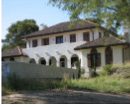
BRUCE MANOR SOHE 2008