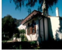
H01998 bruce manor frankston exterior