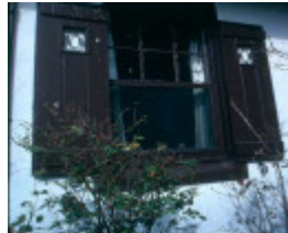
H01998 bruce manor frankston detail