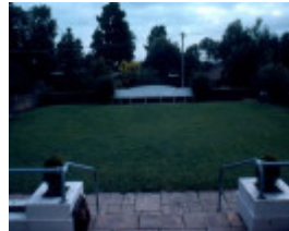
H01998 bruce manor frankston yard