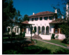
H01998 1bruce manor