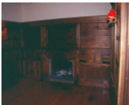
Bruce Manor Frankston Study