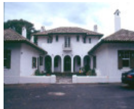
Bruce Manor Frankston Rear