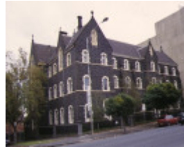
1 former christian brothers college external front