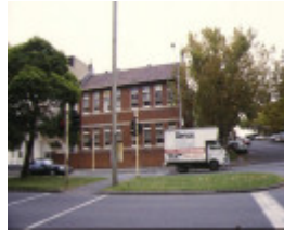
former christian brothers college external back