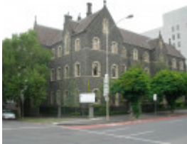
CATHEDRAL COLLEGE SOHE 2008