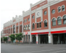
FORMER VICTORIA BREWERY SOHE 2008