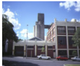
former victoria brewery victoria parade east melbourne side view oct1985