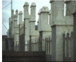
former victoria brewery victoria parade east melb detail of castellated style roof sep1985