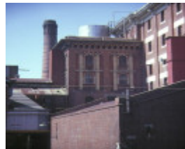
former victoria brewery victoria parade east melbourne rear view mar1985