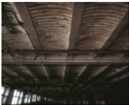
former victoria brewery victoria parade east melbourne interior cellar ceiling sep1985