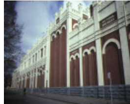
former victoria brewery victoria parade east melbourne front view sep 1985