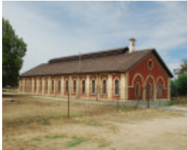
FORMER RAILWAY ENGINE SHED SOHE 2008