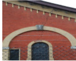
FORMER RAILWAY ENGINE SHED SOHE 2008