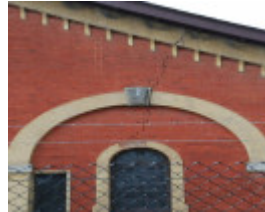
FORMER RAILWAY ENGINE SHED SOHE 2008