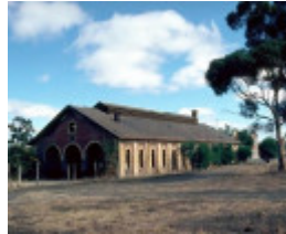
H1060 engine shed echuca