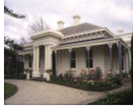
1 claremont noble street newtown front view jul1995