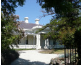
CLAREMONT SOHE 2008