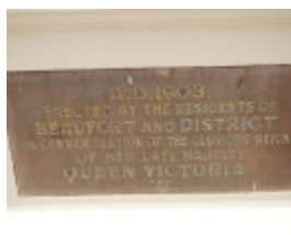
Beaufort Band Rotunda