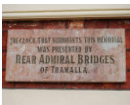
Beaufort Band Rotunda