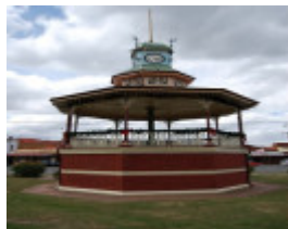
Beaufort Band Rotunda