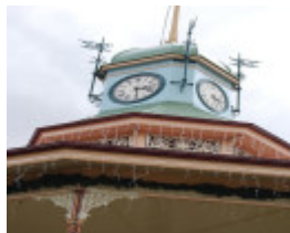
Beaufort Band Rotunda