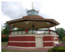
Beaufort Band Rotunda