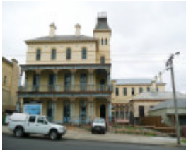
OZONE HOTEL SOHE 2008