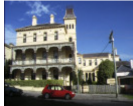
1 ozone hotel gellibrand street queenscliff front elevation sep1987