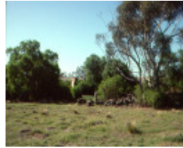
1 rockbank inn archaeological site