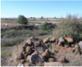
ROCKBANK INN SOHE 2008