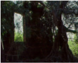
Rockbank Olive Tree