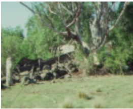
Rockbank shed ruin