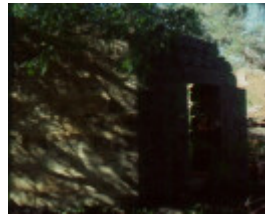
Rockbank Wall Ruin