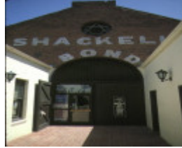
shackells bond store echuca entrance feb1983