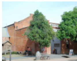
SHACKELLS BOND STORE SOHE 2008