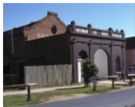
shackells bond store echuca side view may1979