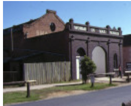
shackells bond store echuca side view may1979