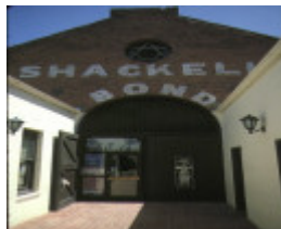
shackells bond store echuca entrance feb1983