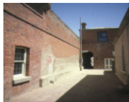
shackells bond store echuca rear view feb1983