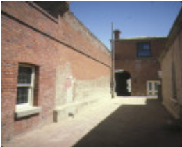
shackells bond store echuca rear view feb1983