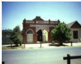
1 shackells bond store echuca front view feb1983