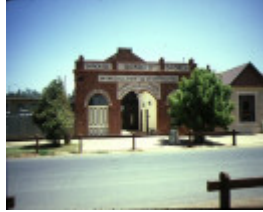
1 shackells bond store echuca front view feb1983