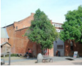
SHACKELLS BOND STORE SOHE 2008