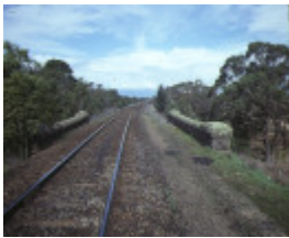
rail bridge & embankment geelong ballarat line elaine rail detail