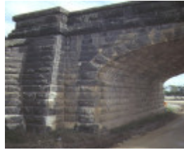
rail bridge & embankment geelong ballarat line elaine arch detail aug 84