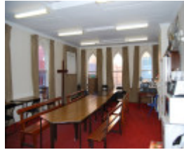
4246 Chinese Mission Church 9. First floor interior.