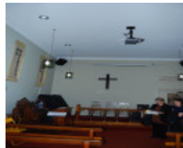
H2175 Chinese Mission Church. Ground floor.