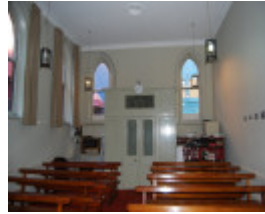
4246 Chinese Mission Church. Ground floor interior.