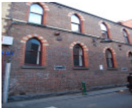
4246 Chinese Mission Church 14. Heffernan Lane facade