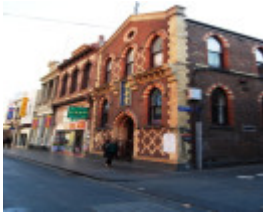
H2175 Chinese Mission Church Little Bourke Street May 2008 compressed