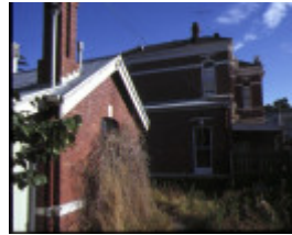
former elsternwick post office rear view