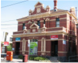
FORMER ELSTERNWICK POST OFFICE SOHE 2008