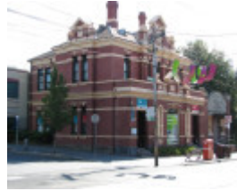
FORMER ELSTERNWICK POST OFFICE SOHE 2008