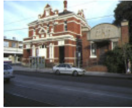
1 former elsternwick post office front view