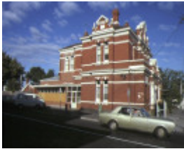
former elsternwick post office side view