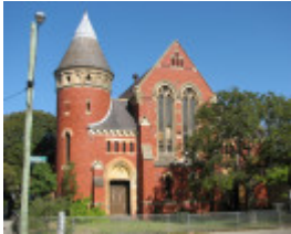
FORMER UNION CHURCH SOHE 2008