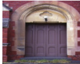
former union church elsternwick front entrance detail