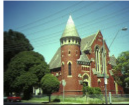
1 former union church elsternwick exterior view