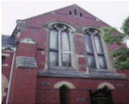
former union church elsternwick front window detail