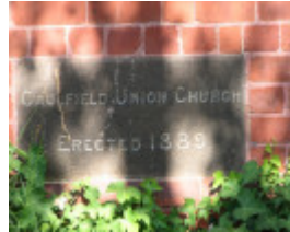
FORMER UNION CHURCH SOHE 2008