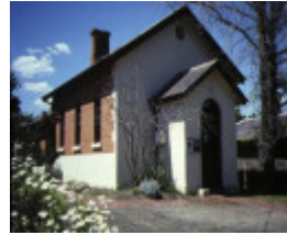
eltham court house main road eltham front corner elevation