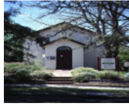
1 eltham court house main road eltham front entrance