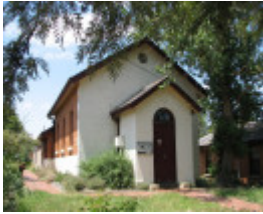
ELTHAM COURT HOUSE SOHE 2008