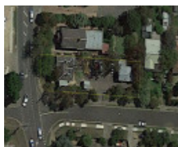
Aerial view of extent of registration