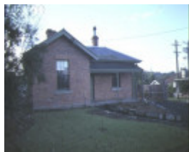
1 former police quarters main road eltham front view apr1986