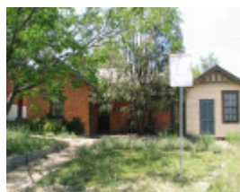
FORMER POLICE QUARTERS SOHE 2008