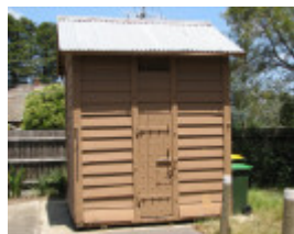
FORMER POLICE QUARTERS SOHE 2008