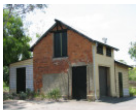
FORMER POLICE QUARTERS SOHE 2008