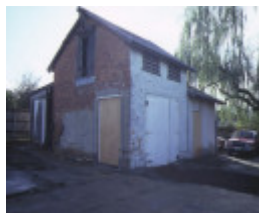
former police quarters main road eltham stables apr1986