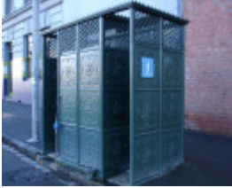
Urinal Queensberry & Elizabeth St exterior KJ 21 06 2007