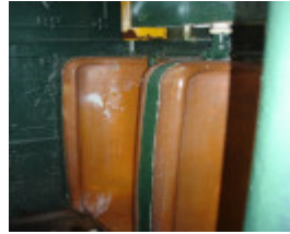
Urinal Queensberry & Swanston terracotta stall KJ 21 06 2007