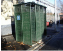
Urinal Queensberry & Swanston exterior view KJ 21 06 2007