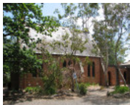
ST MARGARETS CHURCH AND ORIGINAL VICARAGE SOHE 2008