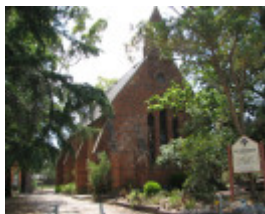
ST MARGARETS CHURCH AND ORIGINAL VICARAGE SOHE 2008