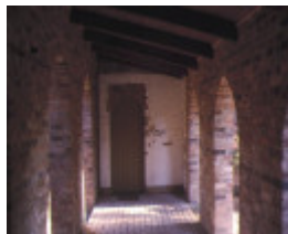
st margaret's church & original vicarage pitt street eltham external entrance arches oct1978