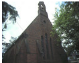
st margaret's church & original vicarage pitt street eltham front-elevation oct1978