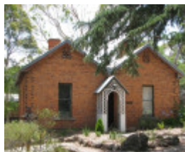
ST MARGARETS CHURCH AND ORIGINAL VICARAGE SOHE 2008