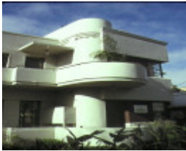
windermere flats broadway elwood detail of central curves