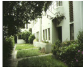
windermere flats broadway elwood side view & garden nov1992