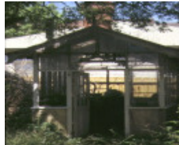
hartpury court complex milton street elwood greenhouse nov1988