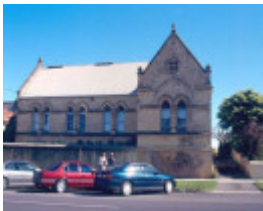
h02076 1 ellerslie college warrnambool front facade 02 oct2004 mz