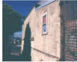
Ellerslie College Warrnambool Side Wall October 2004