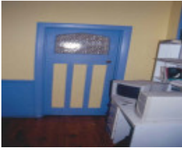
h02076 ellerslie college warrnambool interior 05 oct2004 mz