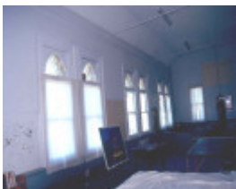
h02076 ellerslie college warrnambool interior 03 oct2004 mz