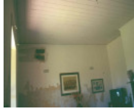
Ellerslie College Warrnambool House Interior October 2004