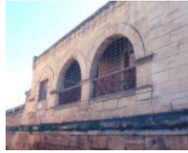
h02076 ellerslie college warrnambool side wall oct2004 mz