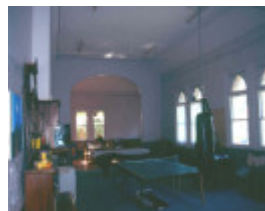
h02076 ellerslie college warrnambool interior 02 oct2004 mz