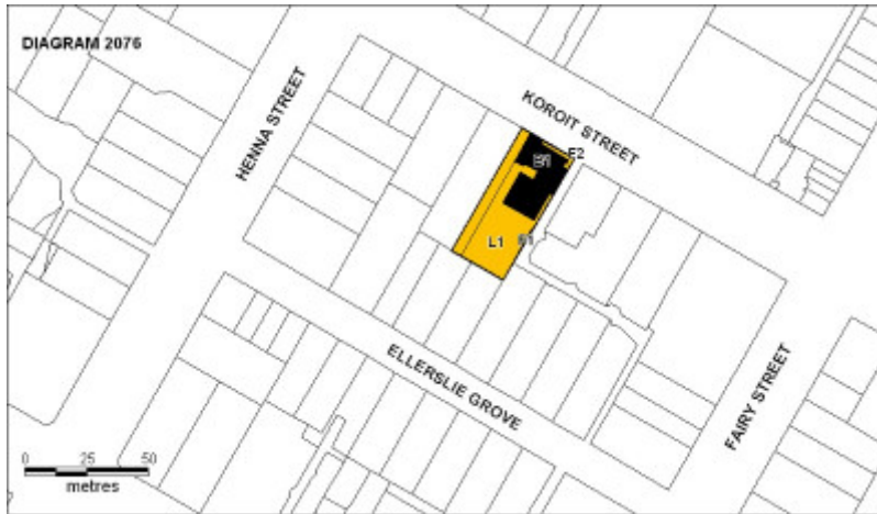
h02076 ellerslie college plan nov2004 mz