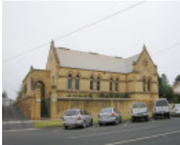
FORMER ELLERSLIE COLLEGE SOHE 2008