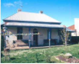
h02076 ellerslie college warrnambool rear facade 01 oct2004 mz