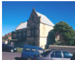
h02076 ellerslie college warrnambool front facade 03 oct2004 mz