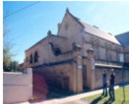
h02076 ellerslie college warrnambool front facade 01 oct2004 mz