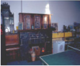
Ellerslie College Warrnambool House Interior October 2004