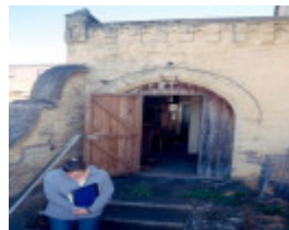
h02076 ellerslie college warrnambool entry 02 oct2004 mz