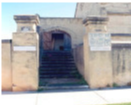
h02076 ellerslie college warrnambool entry 01 oct2004 mz