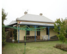
FORMER ELLERSLIE COLLEGE SOHE 2008