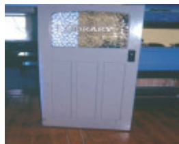
h02076 ellerslie college warrnambool interior 04 oct2004 mz