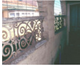
h02076 ellerslie college warrnambool rail detail oct2004 mz