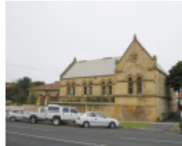
FORMER ELLERSLIE COLLEGE SOHE 2008