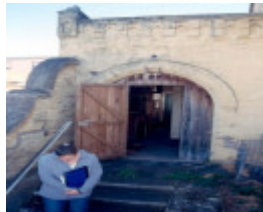
h02076 ellerslie college warrnambool entry 02 oct2004 mz