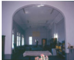
h02076 ellerslie college warrnambool interior 01 oct2004 mz