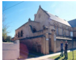
h02076 ellerslie college warrnambool front facade 01 oct2004 mz