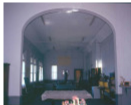
h02076 ellerslie college warrnambool interior 01 oct2004 mz