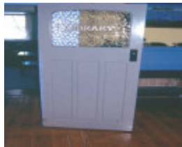
h02076 ellerslie college warrnambool interior 04 oct2004 mz