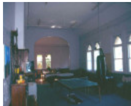
h02076 ellerslie college warrnambool interior 02 oct2004 mz