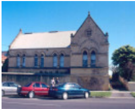
h02076 1 ellerslie college warrnambool front facade 02 oct2004 mz