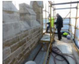
During Photograph - Reference F3866 2015