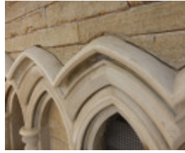
After Photograph - Reference F3866 2016