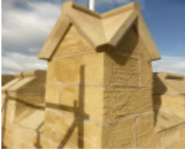
After Photograph - Reference F3866 2016