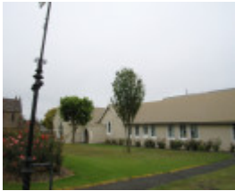
CHRIST CHURCH COMPLEX SOHE 2008