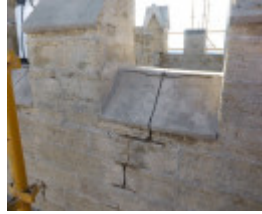
Before Photograph - Reference F3866 2014