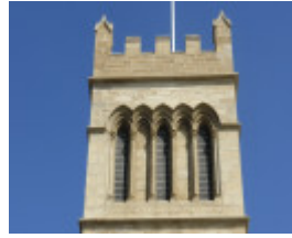
After Photograph - Reference F3866 2016