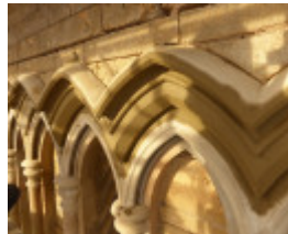
During Photograph - Reference F3866 2015