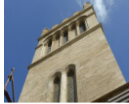
After Photograph - Reference F3866 2016