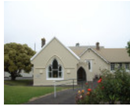
CHRIST CHURCH COMPLEX SOHE 2008