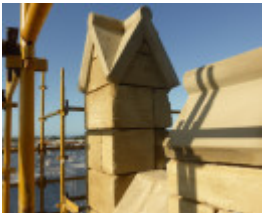
During Photograph - Reference F3866 2015