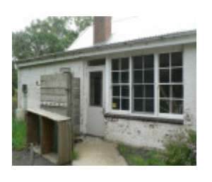
Former Russells Bridge State School, 139 Clyde Hill Road Russells Bridge