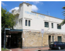
FORMER CHEMIST SHOP SOHE 2008