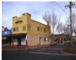
1 former chemist shop ormond road elwood front view