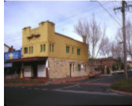
1 former chemist shop ormond road elwood front view