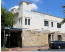
FORMER CHEMIST SHOP SOHE 2008