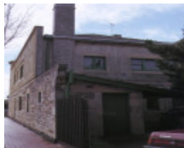
former chemist shop ormond road elwood rear view