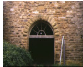
former grieffenhagens winery & homestead emu creek winery entrance