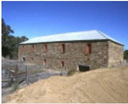
former grieffenhagens winery & homestead emu creek winery front view