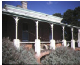
former grieffenhagens winery & homestead emu creek homestead front view may1987