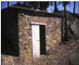
former grieffenhagens winery & homestead emu creek smokehouse may1987