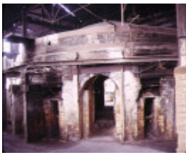
bendigo pottery epsom front view of kiln aug1987