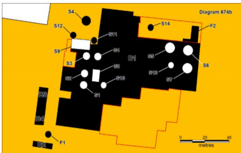
H0674 Bendigo Pottery Plan B Ammended Sept 06