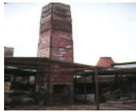
bendigo pottery epsom chimney aug1987