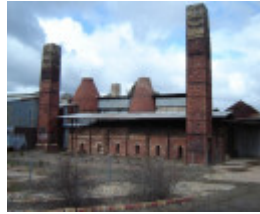
1 Bendigo Pottery North West Facade and Rectangular Kiln 2 (S9), Bottle Kilns 3 & 4 (S3 & S4) and Chimneys 1, 2 & 3 (S10, S11 & S12) 16 August 2005 mz