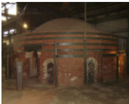
Bendigo Pottery Circular Kiln (S5) 16 August 2005 mz 044