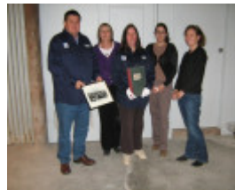
H0674 Bendigo Pottery Heritagecare group