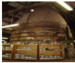
Bendigo Pottery Bottle Kiln (S1) 16 August 2005 mz