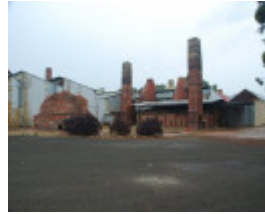
BENDIGO POTTERY SOHE 2008