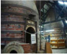
BENDIGO POTTERY SOHE 2008