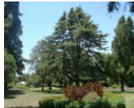
4374_Camperdown Botanic Gardens