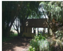
4374_Camperdown Botanic Gardens