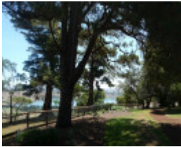
4374_Camperdown Botanic Gardens