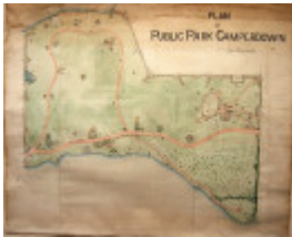
4374_Camperdown Botanic Gardens