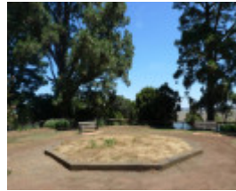
4374_Camperdown Botanic Gardens