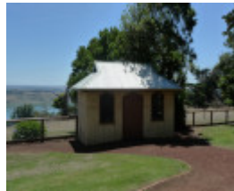
4374_Camperdown Botanic Gardens