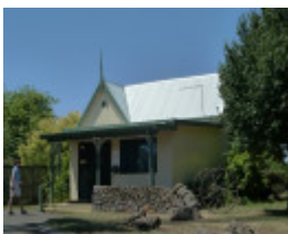
4374_Camperdown Botanic Gardens