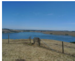
4374_Camperdown Botanic Gardens