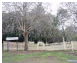
4374_Camperdown Botanic Gardens