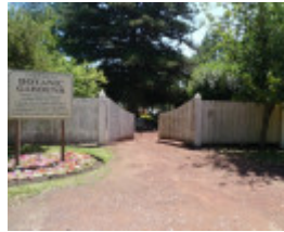
4374_Camperdown Botanic Gardens