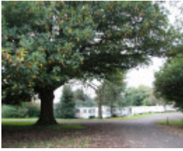
4374_Camperdown Botanic Gardens