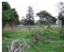
4374_Camperdown Botanic Gardens