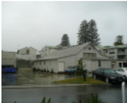
ERSKINE HOUSE SOHE 2008