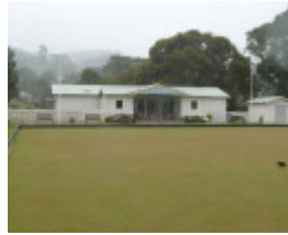
ERSKINE HOUSE SOHE 2008