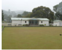
ERSKINE HOUSE SOHE 2008