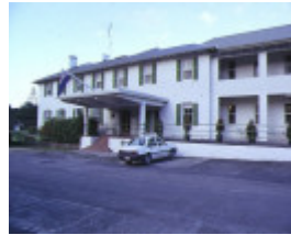
1 erskine house mountjoy parade lorne front view