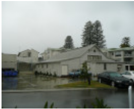
ERSKINE HOUSE SOHE 2008