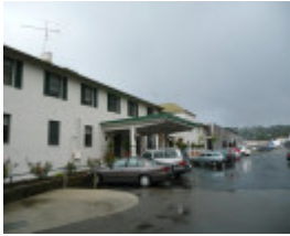
ERSKINE HOUSE SOHE 2008