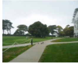
ERSKINE HOUSE SOHE 2008