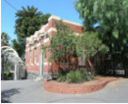
ESSENDON RAILWAY STATION COMPLEX SOHE 2008