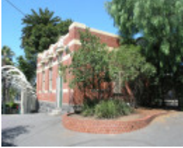
ESSENDON RAILWAY STATION COMPLEX SOHE 2008