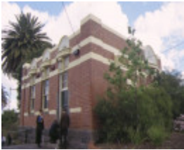
essendon railway station complex buckley street essendon street elevation oct1998