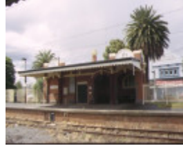
essendon railway station complex buckley street essendon platform 1 view oct1998