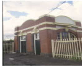
essendon railway station complex buckley street essendon store building oct1998