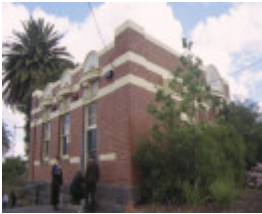
essendon railway station complex buckley street essendon street elevation oct1998