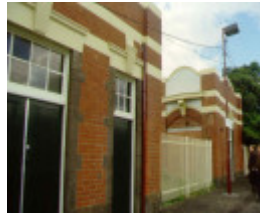
essendon railway station complex store buildings sw oct 1998