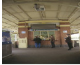
essendon railway station complex buckley street essendon central platform ticket box oct1998