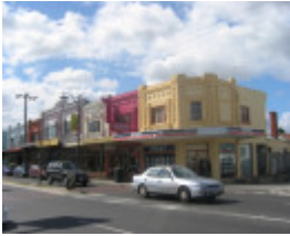
High Street Precinct, Preston