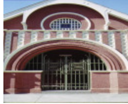
euroa courthouse detail of entrance