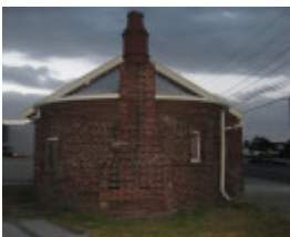
Former Ferry Terra Cotta & enamel brickworks office albert Street brunswick