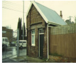
former ferry terra cotta & enamelled brickworks office albert street brunswick aug1996