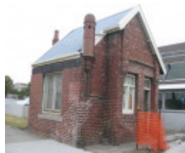
Former Ferry Terra Cotta & enamel brickworks office albert Street brunswick from the northwest