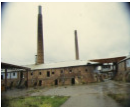
Former Ferry Terra Cotta & Enamelled Brickworks Office Albert Street Brunswick Kiln 1997