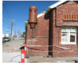
FORMER FERRY TERRA COTTA AND ENAMELLED BRICKWORKS OFFICE SOHE 2008