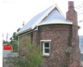
Former Ferry Terra Cotta & enamel brickworks office albert Street brunswick rounded end from the southeast