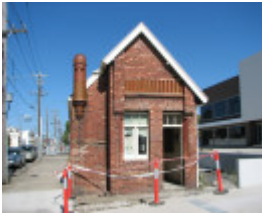
FORMER FERRY TERRA COTTA AND ENAMELLED BRICKWORKS OFFICE SOHE 2008