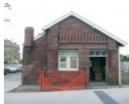
Former Ferry Terra Cotta & enamel brickworks office albert Street brunswick west facade with door open