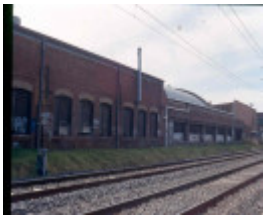
H02027 2 retort house brunswick nov 2002