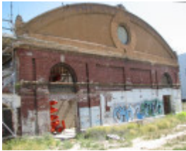
FORMER BRUNSWICK GAS & COKE COMPANY RETORT HOUSE SOHE 2008