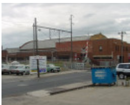
Former Brunswick Gas Works