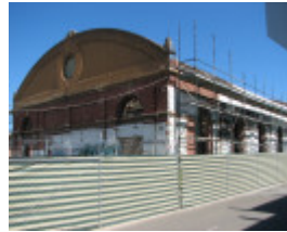
FORMER BRUNSWICK GAS & COKE COMPANY RETORT HOUSE SOHE 2008