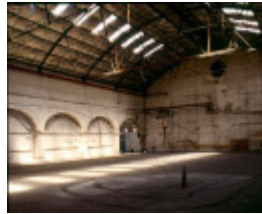
H02027 retort house brunswick nov 2002