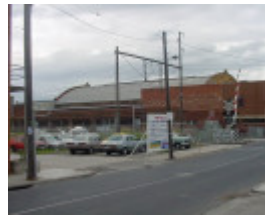
Former Brunswick Gas Works