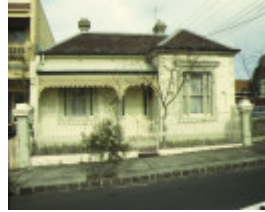
1 residence stewart street brunswick front view 1996