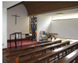
Monash Religious Centre_interior small chapel_KJ_Aug 08