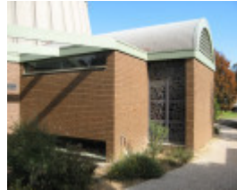
Monash Religious Centre_exterior small chapel_KJ_Aug 08