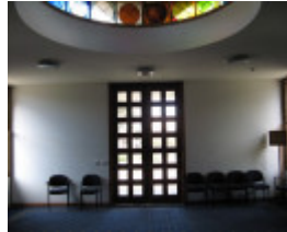
Monash Religious Centre_interior narthex_KJ_Aug 08