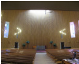
Monash Religious Centre_interior large chapel_KJ_Aug 08