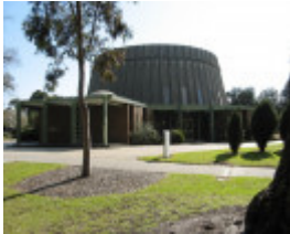
Monash Religious Centre_exterior_KJ_August 08