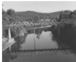
h01214 genoa river timber and concrete bridge b w photo