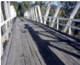
h01214 timber truss and concrete bridge over genoa river genoa decking she project 2003