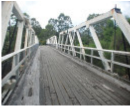
TIMBER TRUSS AND CONCRETE BRIDGE SOHE 2008