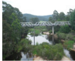
TIMBER TRUSS AND CONCRETE BRIDGE SOHE 2008