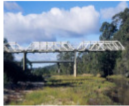
h01214 1 timber truss and concrete bridge over genoa river genoa western side she project 2003