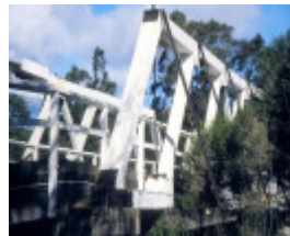
h01214 timber truss and concrete bridge over genoa river genoa northern end she project 2003