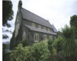
1 church of st peter & st paul mercer street geelong side view apr1997