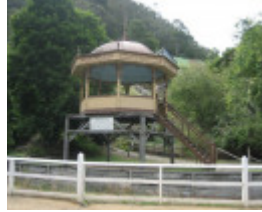
Walhalla Bandstand from the south