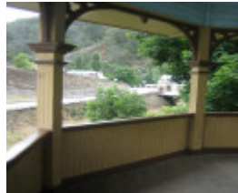
Walhalla Bandstand looking towards stone wall