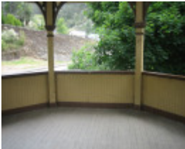
Walhalla bandstand interior looking out