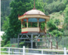
WALHALLA BANDSTAND SOHE 2008