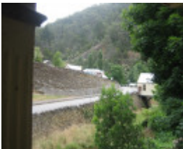
Walhalla Bandstand looking toward former Post Office