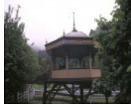
1 walhalla bandstand walhalla front view