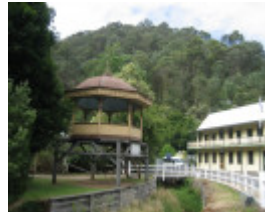
Walhalla Bandstand with Star Hotel