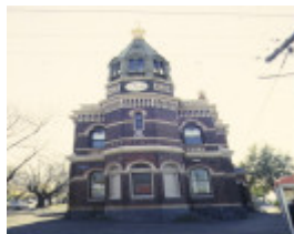
1 flemington post office wellington street flemington front elevation jun1996