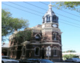
FLEMINGTON POST OFFICE SOHE 2008