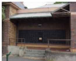
flemington post office wellington street flemington post boxes she project 2004