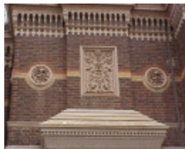
flemington post office wellington street flemington decoration she project 2004