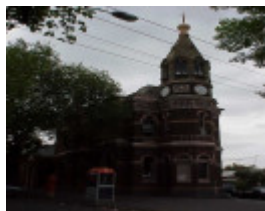
Flemington Post Office Wellington Street Flemington Front View From Street SHE Project