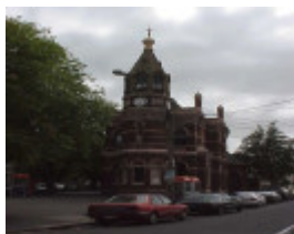
Flemington Post Office Wellington Street Flemington Front View From Street SHE Project 2004