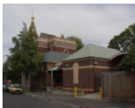
flemington post office wellington street flemington rear she project 2004