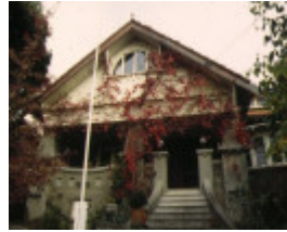
Glendalough Cashmere Street Ascot Vale Front View May 1996