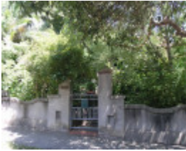
GLENDALOUGH SOHE 2008