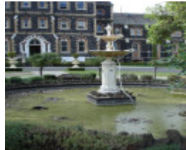
Rose fountain 12 April 2007