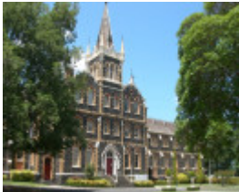
FORMER VICTORIAN DEAF AND DUMB INSTITUTION SOHE 2008