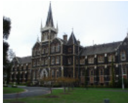
H2122 Deaf school front facade 4 May 07