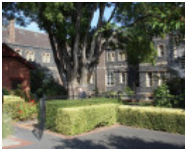
Rear courtyard & camphor laurel tree