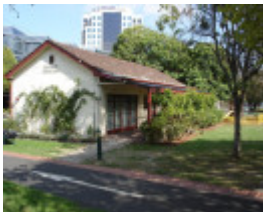
W D Cook Pre-school