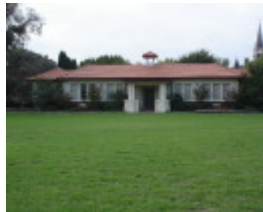
1928 school front facade