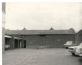
Porter prefabricated iron store