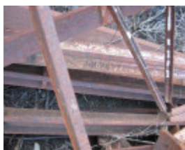
Porter prefabricated iron store