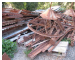
Porter prefabricated iron store