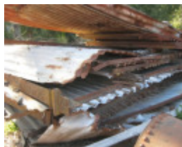
Porter prefabricated iron store