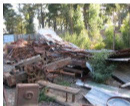
Porter prefabricated iron store