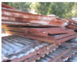
Porter prefabricated iron store