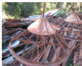
Porter prefabricated iron store