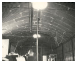
Porter prefabricated iron store