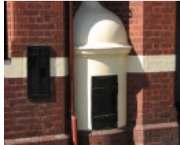
FORMER RICHMOND SOUTH POST OFFICE SOHE 2008