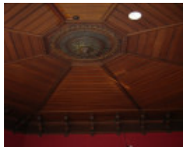
h00048 richmond south post office april05 ceiling public