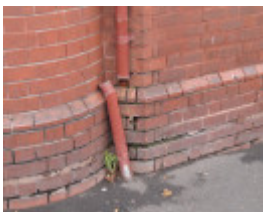
H0048 FORMER RICHMIND SOUTH POST OFFICE LHA 2015 3.JPG