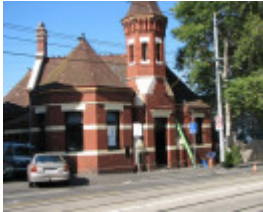
FORMER RICHMOND SOUTH POST OFFICE SOHE 2008