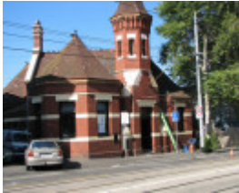
FORMER RICHMOND SOUTH POST OFFICE SOHE 2008