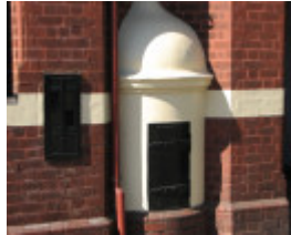
FORMER RICHMOND SOUTH POST OFFICE SOHE 2008