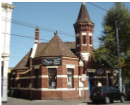
h00048 richmond south post office april05 exterior5