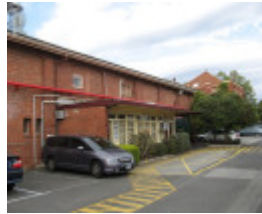
Former Wertheim factory Richmond_west end of south wing_Feb 08