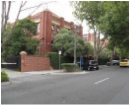
Former Wertheim factory_Bendigo St_Feb 08