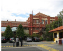
Former Wertheim Factory Richmond_southern elevation of east wing_Feb 08