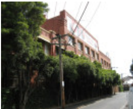
Former Wertheim factory Richmond_north wing incl Heinz additions_Feb 08