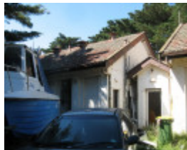
Beam Wireless Receiving Station Mt Cottrell porch between 2 operations bldgs