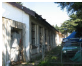
Beam Wireless Receiving Station Mt Cottrell side of operations building