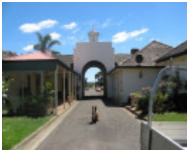
Beam Wireless Receiving Station Mt Cottrell rear of recreation bldg