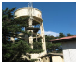
Concrete water tower