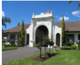
Beam Wireless Receiving Station Mt Cottrell recreation bldg