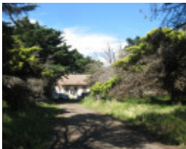
Beam Wireless Receiving Station Mt Cottrell operations bldgs