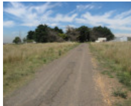
Beam Wireless Receiving Station Mt Cottrell road to operations complex