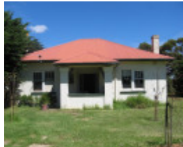
Beam Wireless Receiving Station Mt Cottrell family cottage