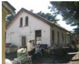
Beam Wireless Receiving Station Mt Cottrell operations buildings from west