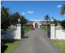
Entrance to accommodation complex