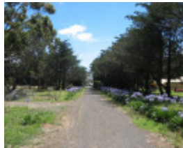
Beam Wireless Receiving Station Mt Cottrell cypress avenue at rear