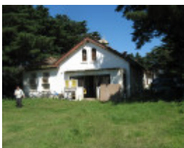
Beam Wireless Receiving Station Mt Cottrell operations buildings from east