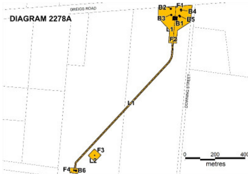
cotrell a revised by heritage council.jpg