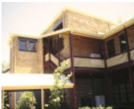
former national school bell street fitzroy rear view of terrace dec1994