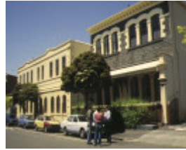
1 former national school bell street fitzroy street view dec1994