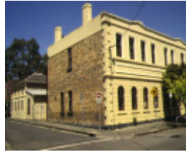
former national school bell street fitzroy front corner view dec1994