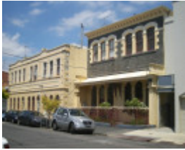
FORMER NATIONAL SCHOOL SOHE 2008