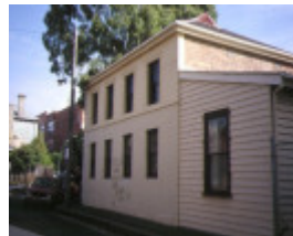
former national school bell street fitzroy building 2 1994