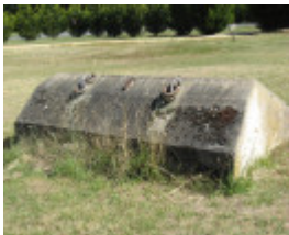
Fiskville concrete block for guy wire anchor