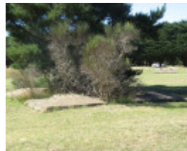
Fiskville concrete pads for mast base