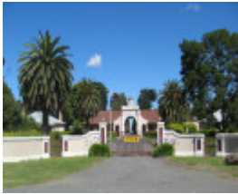
Entrance to accommodation complex