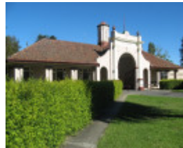
Fiskville recreation building