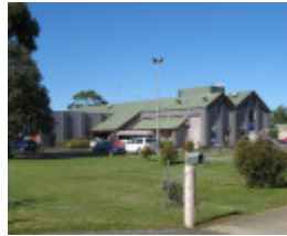
Fiskville power generating building