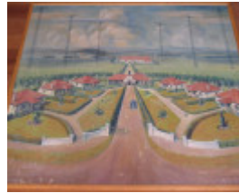
Fiskville painting of complex c1920s