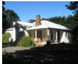
Fiskville manager's residence