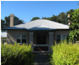
Fiskville one of 8 identical cottages